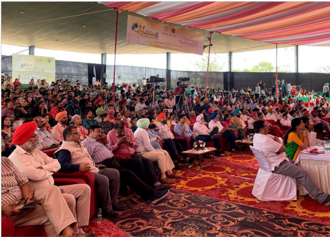
Formal Inauguration of Hunar