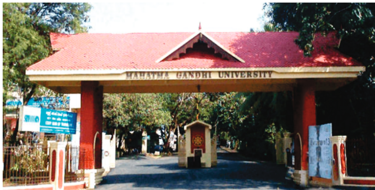
Mahatma Gandhi University

Welcome to the vibrant world of creativity and talent at the 37th Inter-University National Youth Festival hosted by PAU, Ludhiana! With over 2000 students representing more than 100 universities from across India, this festival promises a spectacular showcase of dance, drama, music, fine arts, and literary prowess. Among the participants are the champions of the eight zonal youth festivals, each bringing their unique flair and passion to the stage. In our daily newsletter, we will delve into the inspiring profiles of two zonal winners, celebrating their journey and achievements in the realm of artistic and academic excellence. Stay tuned as we shine a spotlight on the institutions from where remarkable talent will be gracing the stage, igniting inspiration and admiration across the nation!